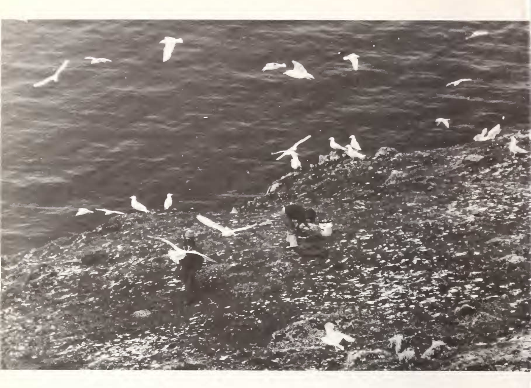
Fig. 18. Gathering gull and eider eggs; Shaiak Island, 14 June 1973.